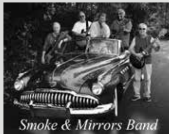
Smoke & Mirrors Band